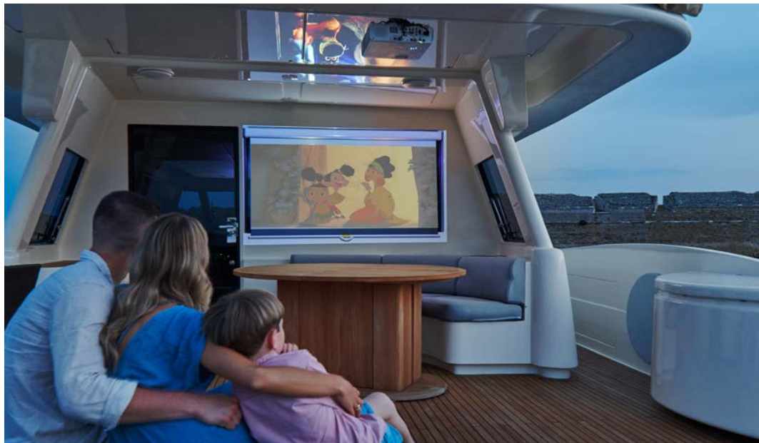
Open-air cinema entertainment