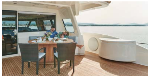
The upper deck is set up beautifully for easy superyacht living, with different areas for dining and relaxing.